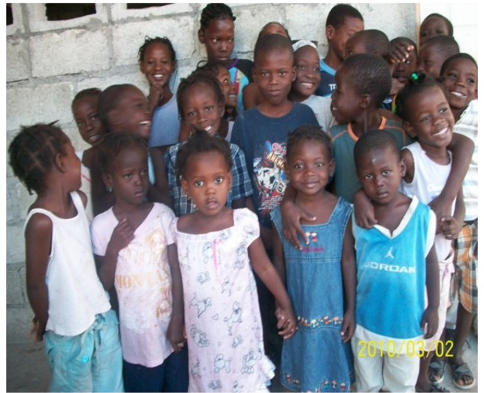
New orphans being cared for at the Williamson School site

Eleven of the 26 people who went with us to Haiti in January are from the Valley County, Nebraska, area. After the earthquake, they challenged their community to raise $25,000 to help build another orphanage for the House of Hope Haiti. So far they have raised about $21,000! Impressively, the children from the community primary and country schools raised about $6,000 of this money! These funds have been a real blessing and will allow us to take in more children than we would have. Construction on the Valley House of Hope begins this month!